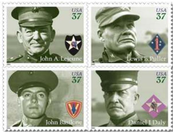
Commemorative Stamps Issued on Nov. 10, 2005

At Camp Lejeune on Nov. 11 the stamps were being sold