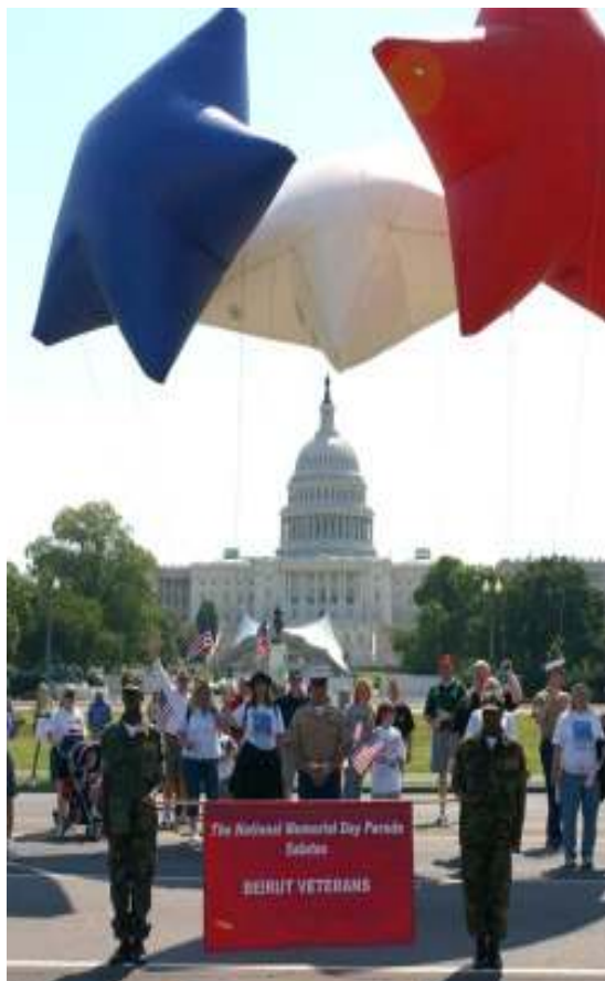
BVA vets carrying star balloons at last year’s First National D.C. Memorial Day Parade