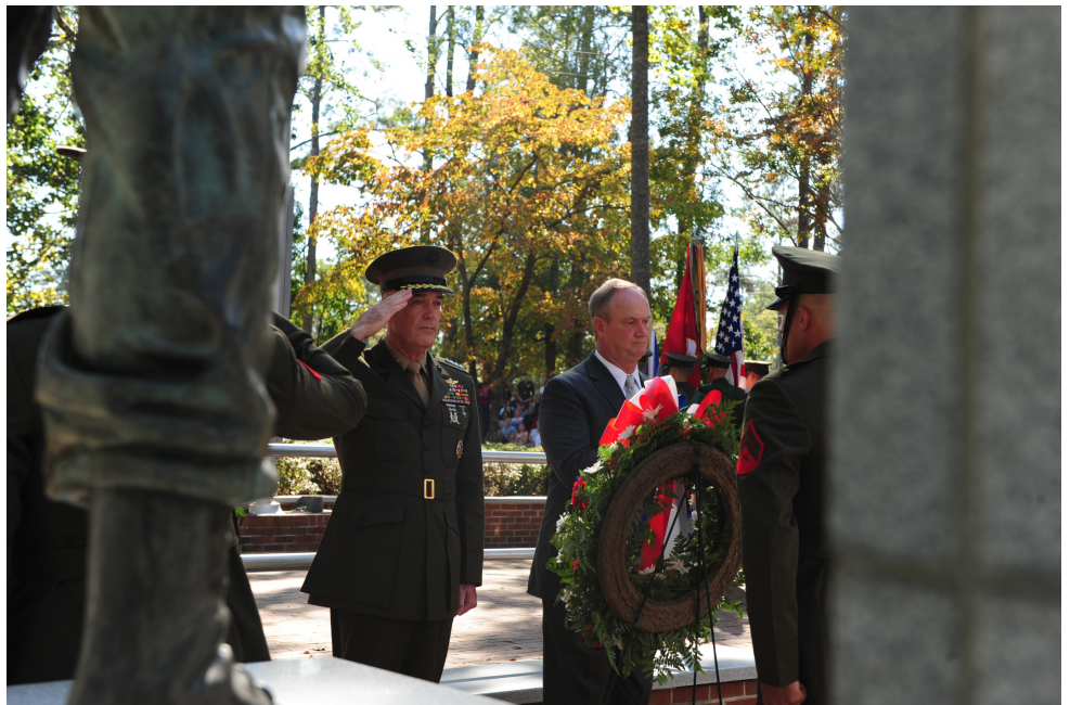
Assistant Commandant of the Marine Corps Gen Joseph F. Dunford renders honors at the Beirut Memorial in Camp Lejeune, NC on Oct 23, 2011.

"The memorial was funded entirely by private donations and it