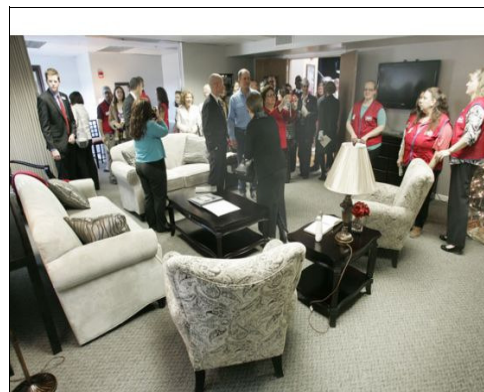
The Remodeled Beirut Room at the USO