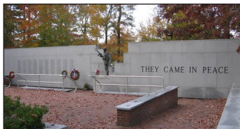
The Beirut Memorial outside Camp Johnson lists the names of those lost.

For years the Rochester Area survivors have attended the Memorial Service at the Beirut Memorial at Camp Johnson, a satellite facility of Camp Lejeune in North Carolina, on the anniversary of the bombing.