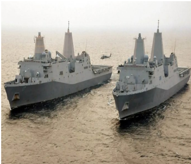
USS San Antonio (LPD-17) USS New York (LPD-21)

The San Antonio-class amphibious ship represents the combined power of the Navy and Marine Corps team and relies on the seamless integration of Sailors and Marines working together. Amphibious transport dock ships are warships that embark, transport and land elements of a landing force for a variety of expeditionary warfare missions. LPDs are used to transport and land Marines, their equipment, and supplies by embarked Landing Craft Air Cushion (LCAC) or conventional landing craft and amphibious assault vehicles (AAV) augmented by helicopters or vertical take-off and landing aircraft (MV 22). These ships support amphibious assault, special operations, or expeditionary warfare missions and serve as secondary aviation platforms for amphibious operations.