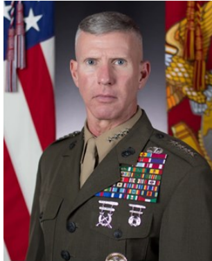
Eric M. Smith, General, U.S. Marine Corps, Commandant